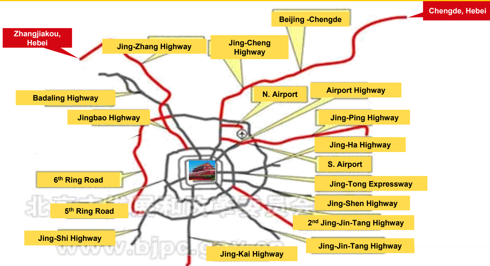
Map of Beijing Highways

Trucks destined to Beijing direction are to be prohibited on highways as from Zhangjiakou and Chengde. Only state level roads are allowed.